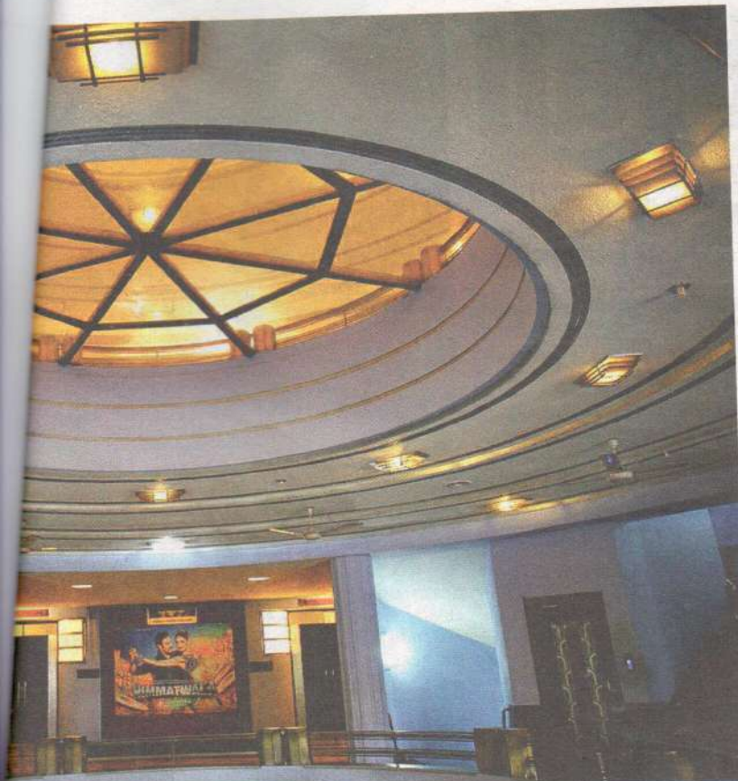
eye-catching as the exterior